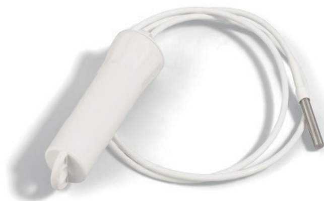
Aranet MINI with Aranet T-probe sensor